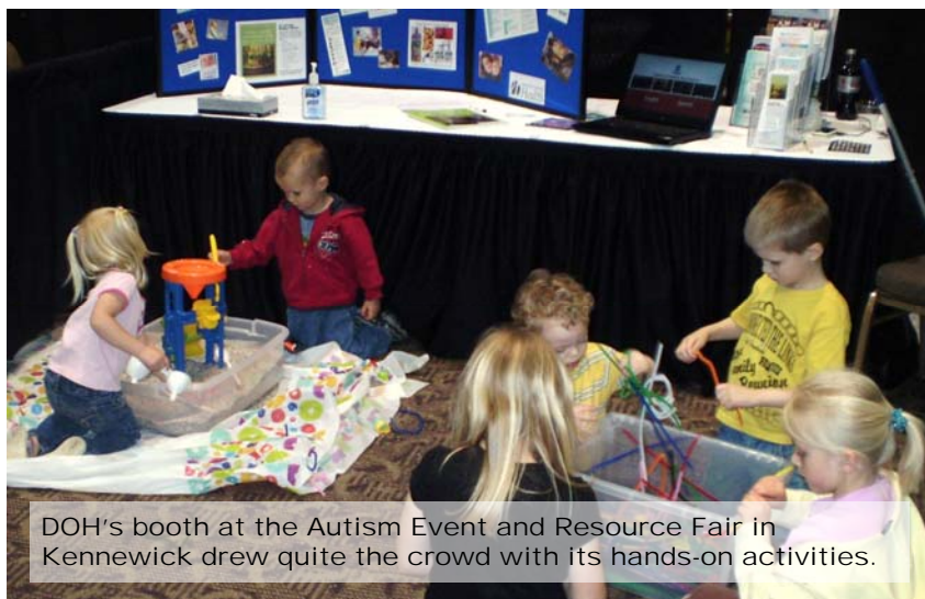
DOH's booth at the Autism Event and Resource Fair in Kennewick drew quite the crowd with its hands-on activities.